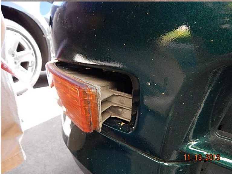
BROKEN AT MOUNT TAB