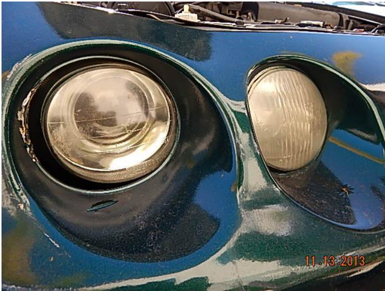
RT HEADLAMP-SCRAPED, CRACKED